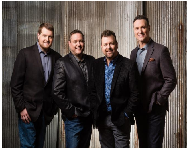
The Old Path's Quartet South Avenue Baptist Church 605 Preston Avenue Pasadena, TX 77503 713-472-0450